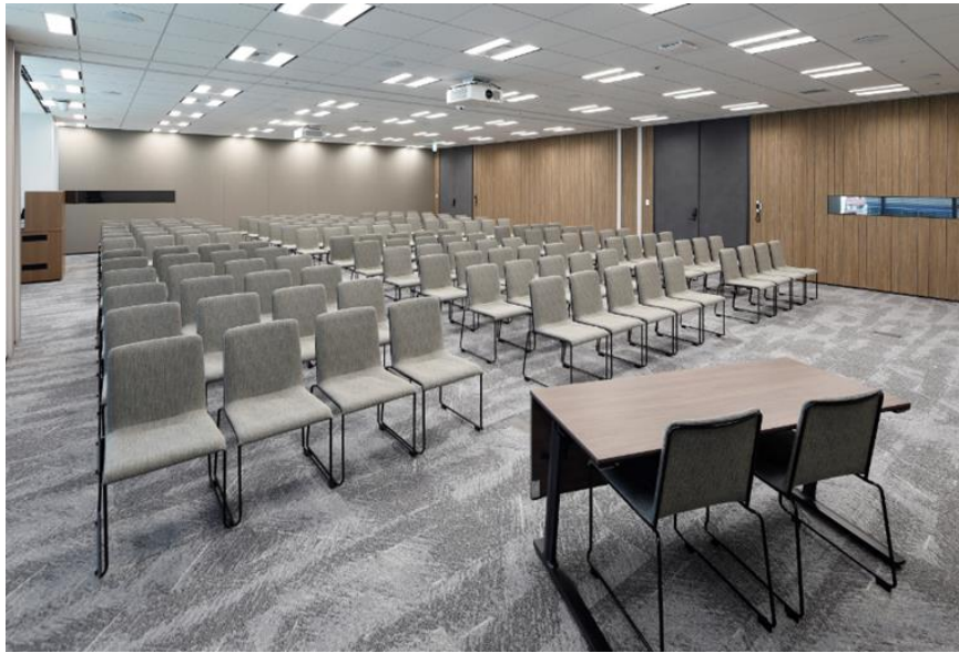
Hearing Room A+B for Seminar