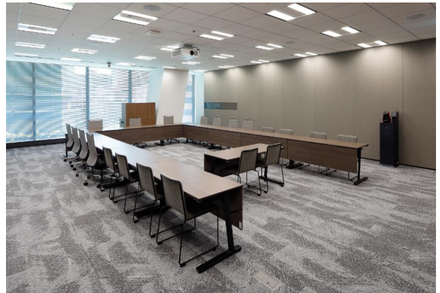
Hearing Room B