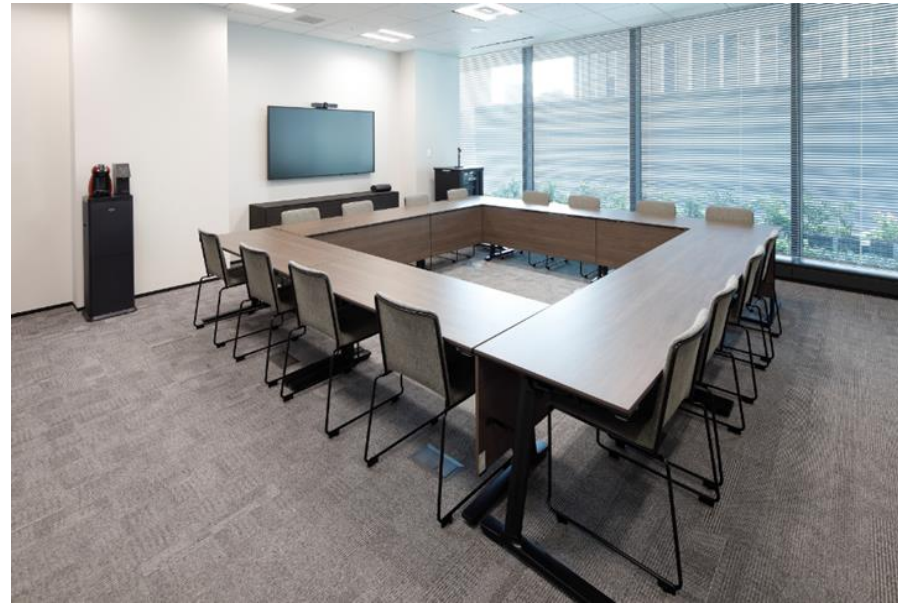
Breakout Room 1