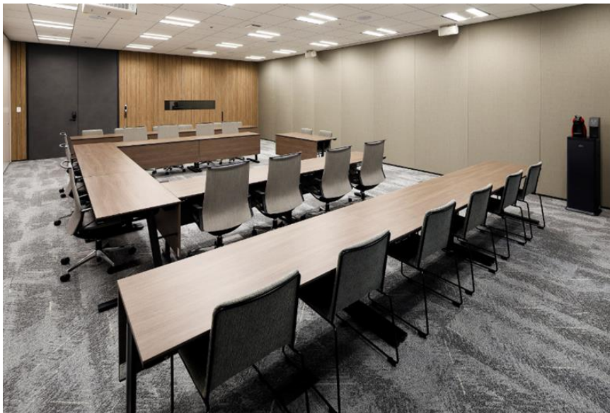
Hearing Room A